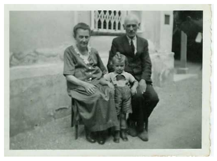
The only surviving photograph, taken in 1937, of myself with my grandparents.

The Jews were now forced by the Nazis to live in cramped conditions in Vienna and we had to move several times. I well remember my father coming back from his imprisonment with his head shaven and looking terrible. The conditions were so severe there that many of the men died.